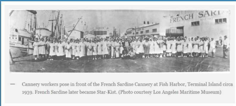
— Cannery workers pose in front of the French Sardine Cannery at Fish Harbor, Terminal Island circa 1939. French Sardine later became Star-Kist.