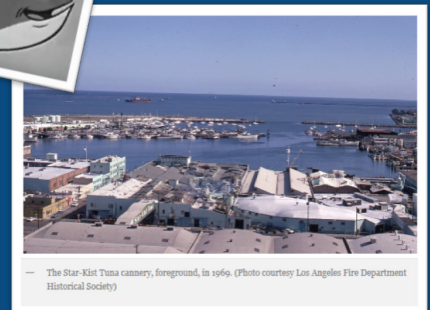
— The Star-Kist Tuna cannery, foreground, in 1960.